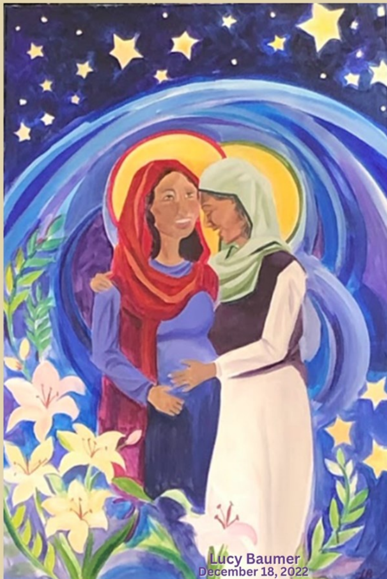
Lucy Baumer December 18, 2022